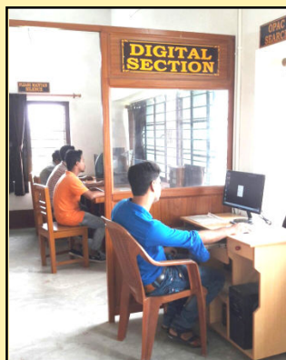
Digital section of Library