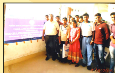
Name of the Programme: