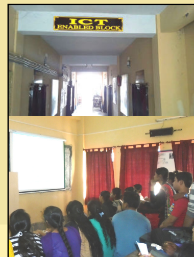
Five well maintained ICT Enabled Class Rooms