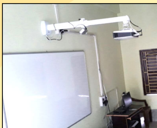
One State-Of-The-Art Virtual Class Room.