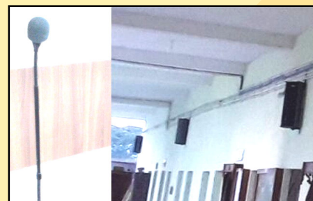
Public Address System