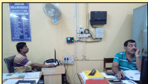
Biometric attendance system