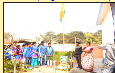
Name of the Programme: Netaji's Birth Anniversary