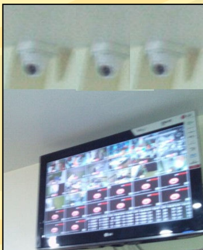
Campus under CC TV Surveillance