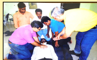
Name of the Programme: