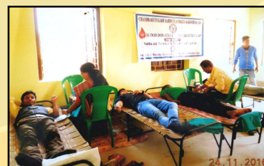
Name of the Programme: