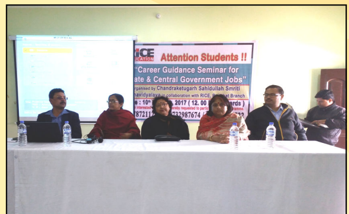
Career Guidance Seminar for State and Central Government Jobs