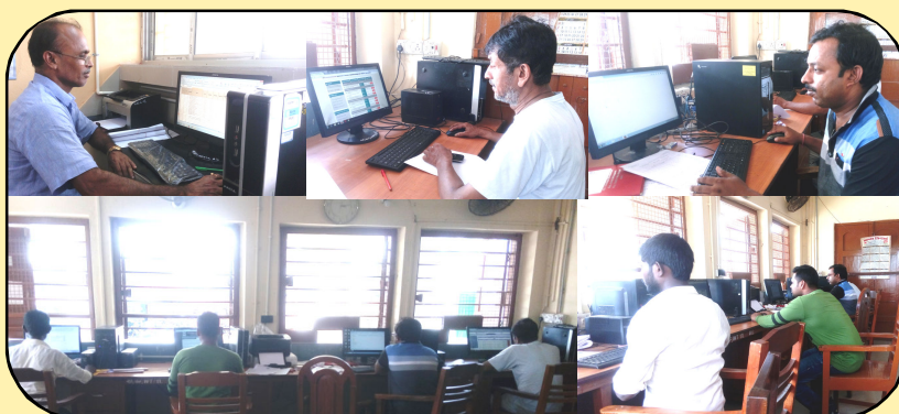
Office using MIS Software