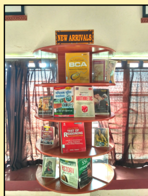
New Arrivals Display

OPAC SEARCH HOME LENDING READING ROOM FACILITIES DAILY & WEEKLY NEWSPAPER FACILITIES CAREER ORIENTED MAGAZINES SEPARATE PERIODICAL SECTION NEW ARRIVAL INTIMATION DIGITAL SECTION FOR E-RESOURCES REPROGRAPHIC SECTION