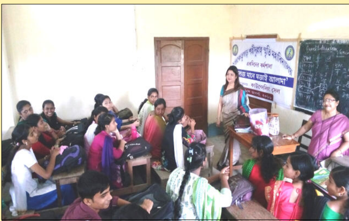
Workshop on Psychological Counselling