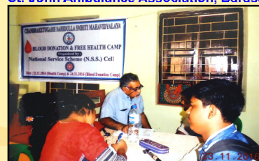
Name of the Programme: Health Camp